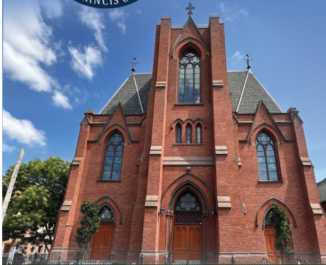
ST. NICHOLAS 26 OLIVE STREET