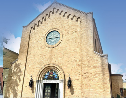
ST. FRANCIS 219 CONSELYEA STREET

SUNDAY / DOMINGO 10:45AM MISA EN ESPAÑOL