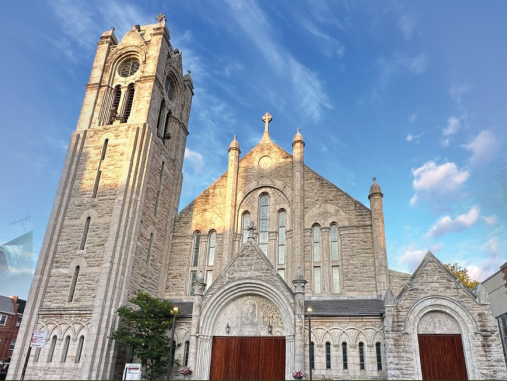
ST. CECILIA 84 HERBERT STREET